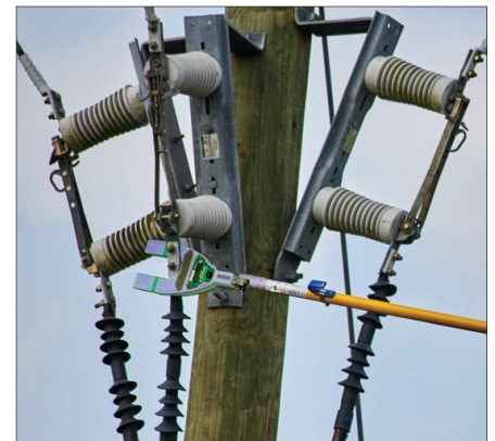
Standard Ampstik+ on Overhead Switch